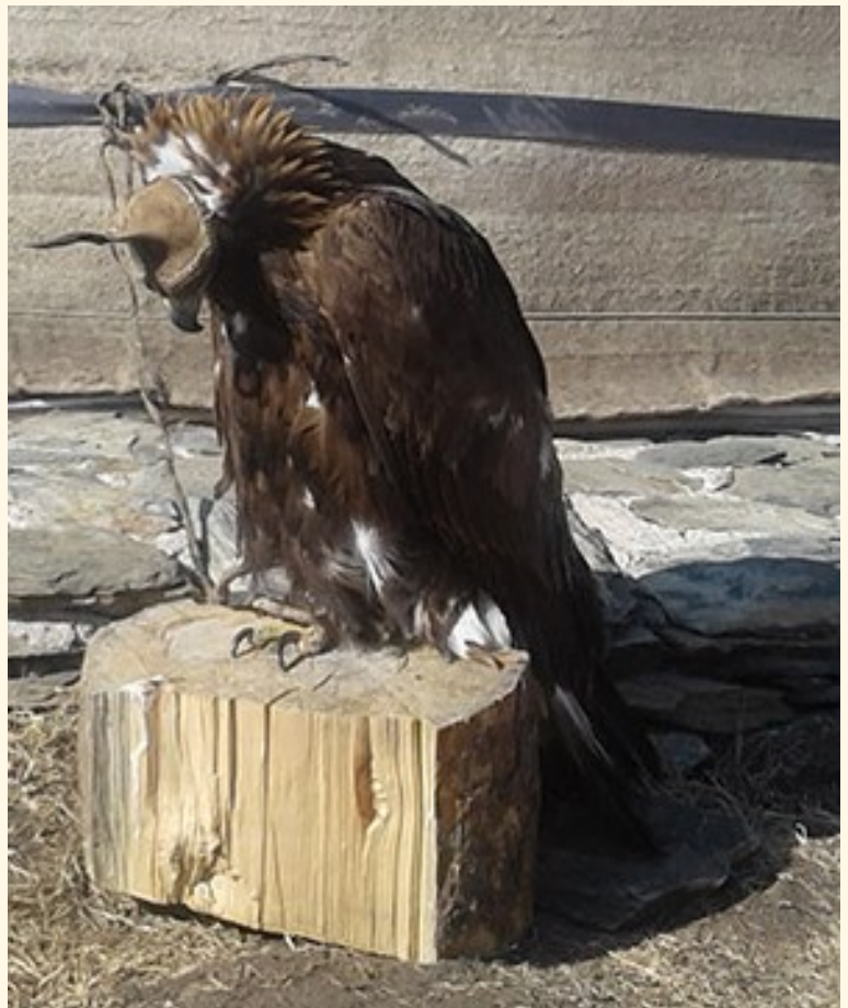
Eagle Festival March 2019